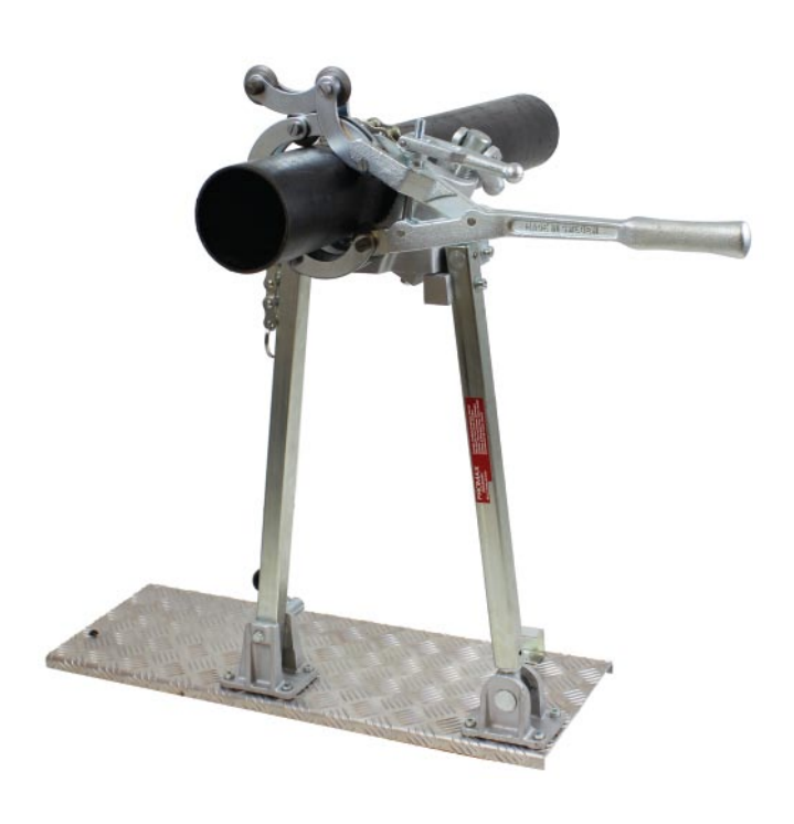
Link Pipe Cutter K6 and Pipe Clamp RH6