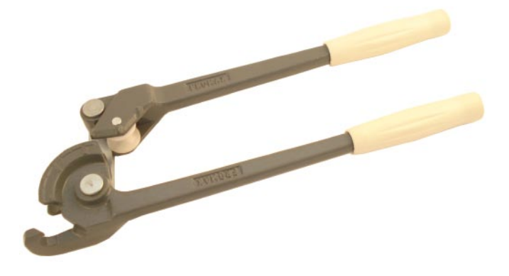
Tube Bender No 65 12 mm