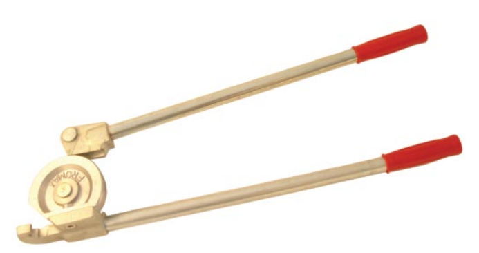
Tube Bender No. 50 18 mm