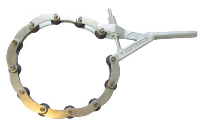
Link Pipe Cutter D12