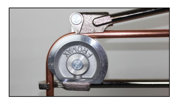
Tube Bender No. 55 15 mm