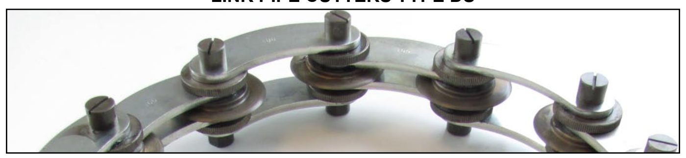
Close-up view of a Link Pipe Cutter type DS

Link Pipe Cutters Type DS has the same design as type D but are developed for the most demanding jobs. Compared with type D, the DS is larger in most aspects. For example the cutting wheels has a diameter of 74 mm instead of 50 mm for type D. With these tools it is possible to cut steel pipes as thick as 10 mm.