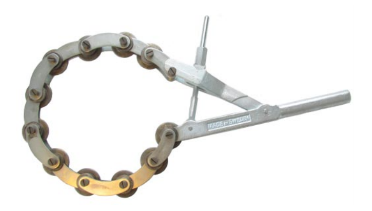
Link Pipe Cutter DS12