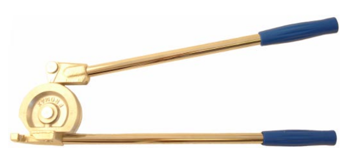
Tube Bender No 55 12 mm