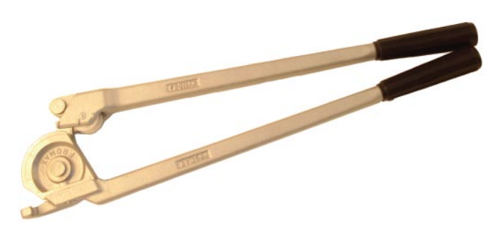
Tube Bender Nr 75 15 mm