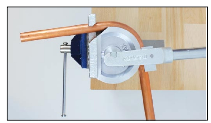
Tube bender No 30 22 mm fixed in a vice