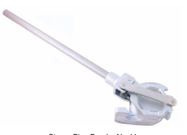
Steam-Pipe Bender No 41

No. 40 & 41 are developed for bending threadable 3/8 " & 1/2" and 1/2" & 3/4" pipes. Two sizes of pipes can be bent in the same tool. The tool is to be fixed in a vice.