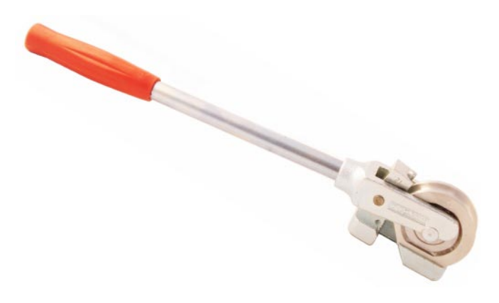
Tube bender No 30 12 mm

Fromax tube benders No. 30 are precision tools for bending soft copper, thin walled steel, stainless, aluminum and similar soft tubes. Uniform and exact bends, of very small radius, are obtained in angles from 0°-180°. The tools are to be fixed in a vice.